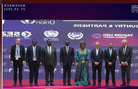
2024 9 th EDITION Nairobi, KENYA