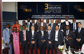
2018 3 rd EDITION Abidjan, COTE D'HIVOIRE