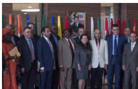
2015 1 st EDITION Tangier, MOROCCO

Through the get-together initiatives, AEZO provides its members a unique opportunity to develop networking, build strong business alliances, and access key international decision-makers.