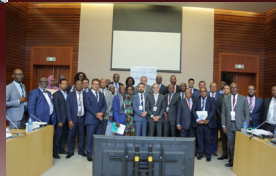
2019 4 th EDITION Addis Abeba, ETHIOPIA