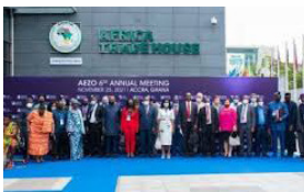
2021 6 th EDITION Accra, GHANA