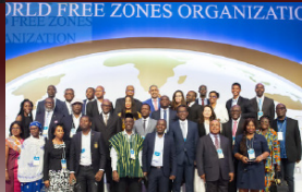
2017 2 nd EDITION Dubai, UAE