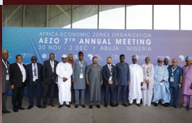
2022 7 th EDITION Abuja, NIGERIA