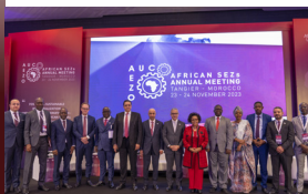
2023 8 th EDITION Tangier, MOROCCO