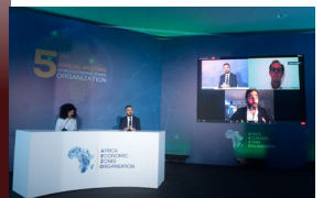
2020 5 th EDITION Virtual