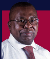
H.E. Albert Muchanga Commissioner Economic Development, Trade, Tourism Industry & Mining – AUC

AFRICAN SEZs ANNUAL MEETING NAIROBI - KENYA | NOVEMBER 27 - 29, 2024