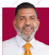
Nassir Abdulsamad Sheriff Governor County Government of Mombasa