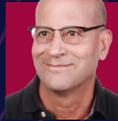
Sid Boubekeur Lead Expert African Union Commission - AUC