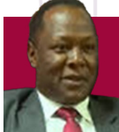
David Ontweka Deputy Commissioner Policy and International Affairs the Kenya Revenue Authority KRA