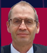
Ondrej Simek Deputy Head Delegation of the European Union