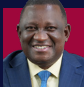
H.E. Salim Mvurya Cabinet Secretary, Ministry of Investments, Trade & Industry Republic of Kenya