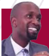
Maina Trading Bells