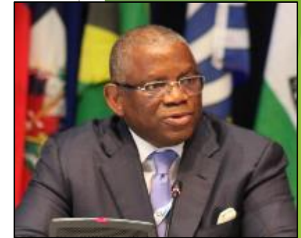
H.E. George Rebelo Pinto CHIKOTI Secretary General OACPS